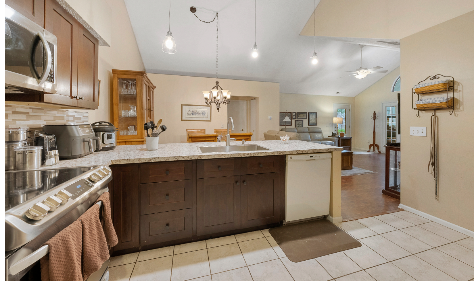
126 Stonebend Drive, Powell, Ohio 43065

All homes in Villas at Riverbend have brick and wood or stone and wood exteriors.