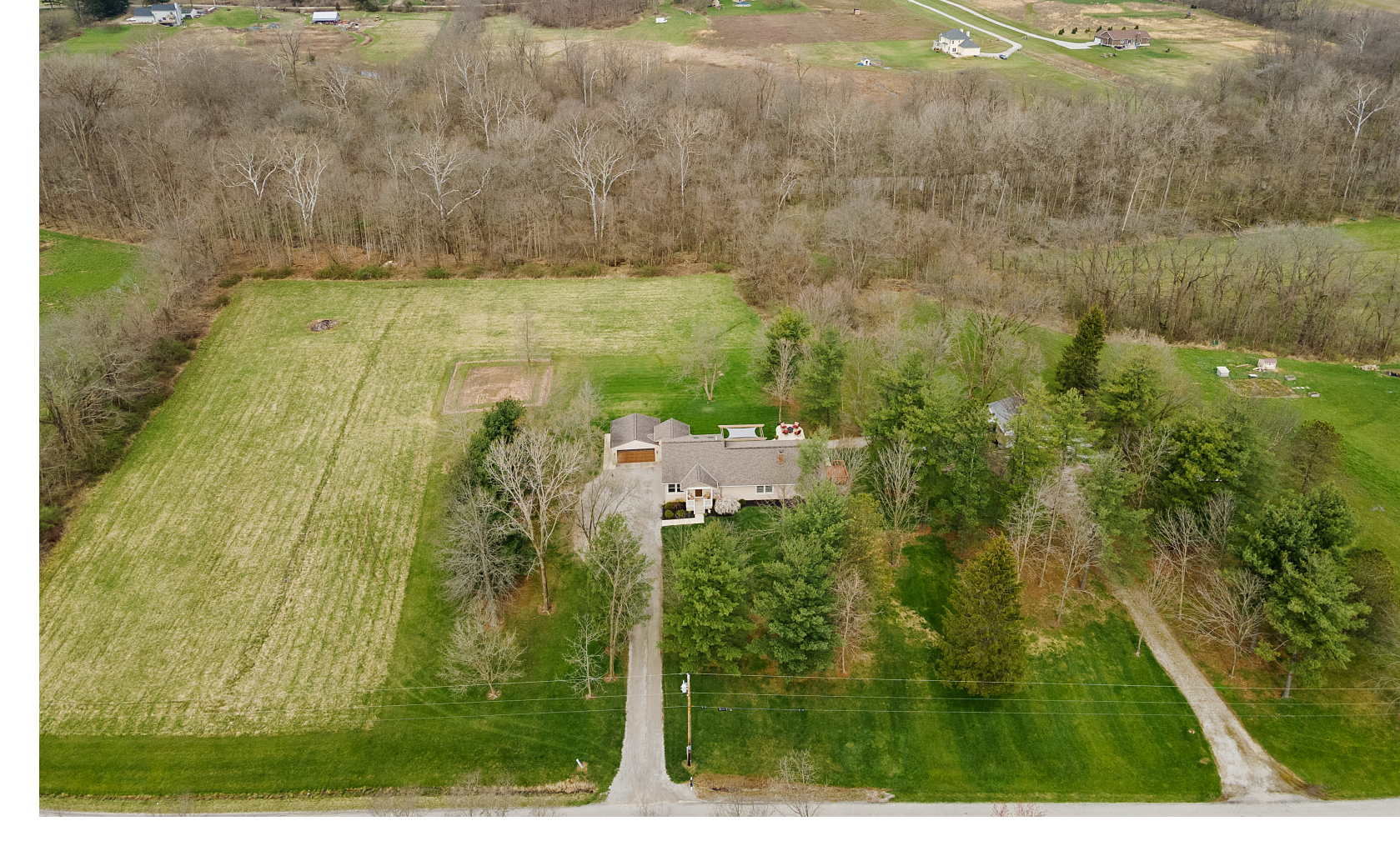
7447 East Liberty Road, Sunbury, Ohio 43074

The second drive is to heated barn/shop with concrete floor and 2 overhead doors. Additional garden shed as well.